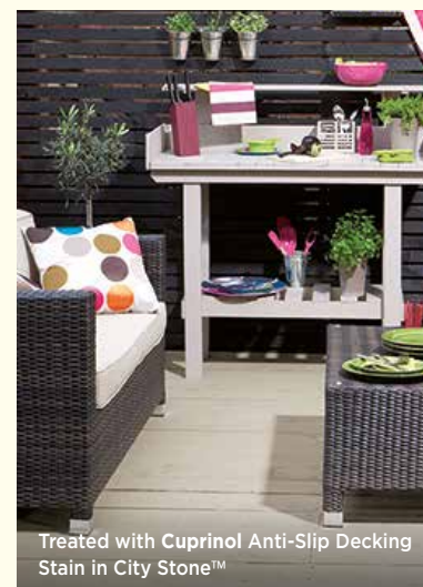
Treated with Cuprinol Anti-Slip Decking Stain in City Stone™

Keep your decking looking its best by protecting it from the elements and the effects of wear and tear. Choose from our range of colourful, durable stains or nourishing, protecting oils for a deck you can feel proud of.