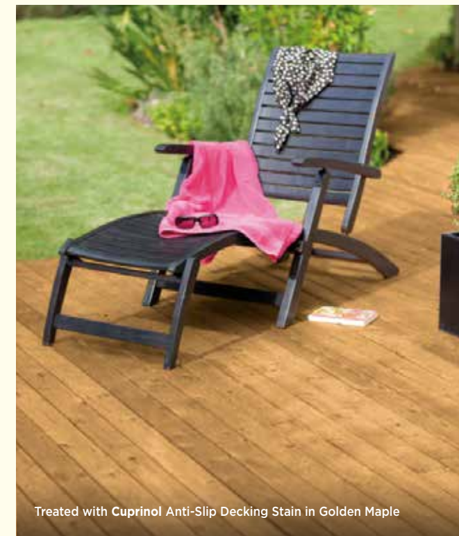
Treated with Cuprinol Anti-Slip Decking Stain in Golden Maple